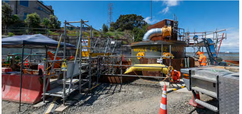
Top of the liner above the shaft