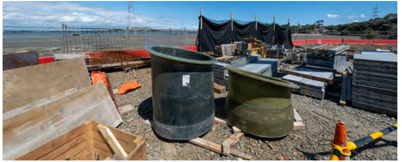
Sections of the GRP liner on site

Thank you for your understanding and support while we carry out this essential work which will benefit Auckland.