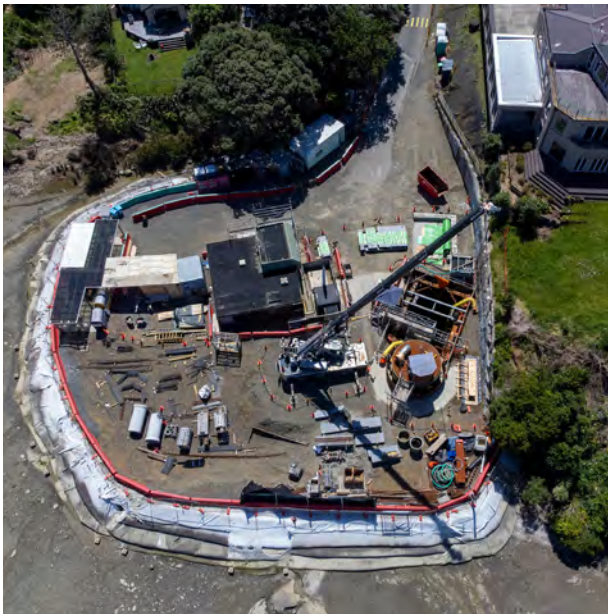
Aerial view of PS23