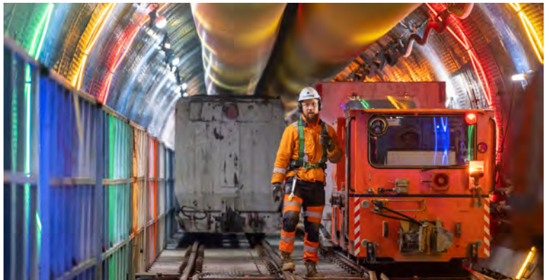
A look inside the tunnel that runs under PS23